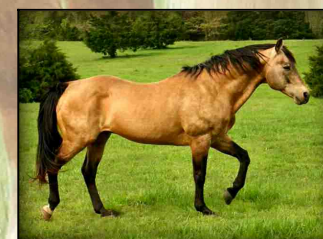
Docs Dry Cutter 1986 Buckskin Stallion

Dry Docs Cutter brings into the River Bluff Ranch the strongest blood in modern cutting through his sire Dry Doc. Dry Doc