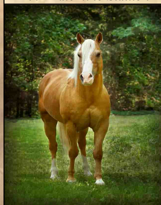
Cutter Bill Dexter 2004 Palomino Stallion

Following the success of using grandsons of Poco Bueno, the River Bluff Ranch introduced the stallions Cutter Bill San and Cutter Bill Dexter, to augment their infusion of the Cutter Bill bloodline.