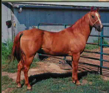
Bills Poco Tona 1982 Red Dun Stallion

One of the mainstay bloodlines for the River Bluff Ranch, and a foundation sire for the program, came through the AQHA Hall of Fame stallion Poco Bueno. The use of the Poco Bueno bloodline came through standing such stallions as Poco Ojos Diego, Poco Too Smooth, Poco Bueno Diego, Poco Pats Ojos, Poco Bueno Sugar Bars, and Bills Poco Tona — all paternal grandsons of Poco Bueno. Poco Ojos Diego, Poco Bueno Diego and Poco Pats Ojos were also double bred to Poco Bueno. The legacy and contribution of Poco Bueno is being carried on by the recent addition of Poco Toms Ojos, a strong dun factored paternal grandson of Poco Bueno. He is also triple bred to Poco Bueno.