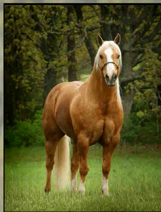
Cutter Bill San 1998 Palomino Stallion

The dam of Bills Poco Tona was Bill's Tona, a mare by the NCHA World Champion Cutting Horse — Cutter Bill. The Cutter Bill bloodline has been famously noted for its disposition. The siring success of Bills Poco Tona in the River Bluff breeding program led to the introduction of the Cutter Bill bloodline.